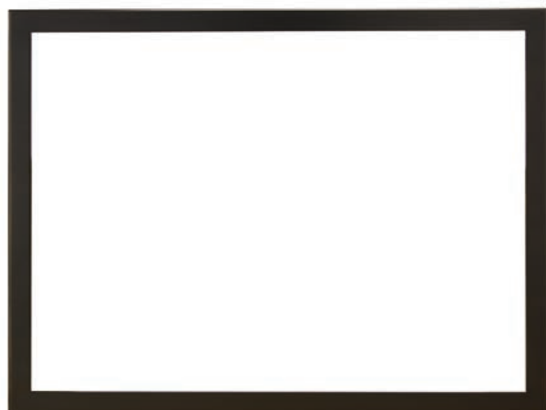
Beveled Window Frame in Oil-Rubbed Bronze

Add a decorative front to your new direct-vent luxury fireplace. Choose the Beveled Window Frame in brushed nickel or oil-rubbed bronze, the Alexandra Doors in brushed nickel (shown on opposite page), or the Forged Iron Doors. Your front or frame attaches in seconds. Each fireplace comes with a fireplace barrier screen to prevent contact with the hot glass. Add the available andirons to convey an old-world look.