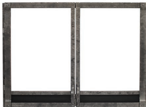
Forged Iron Doors