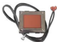
Optional Lighting Kit