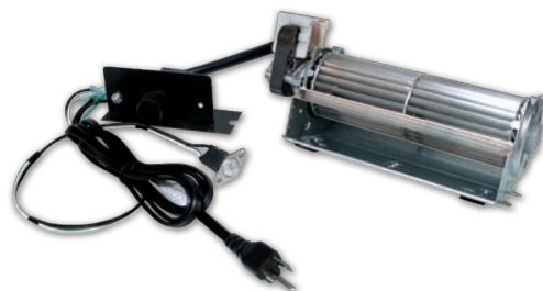
Optional Variable-Speed Blower