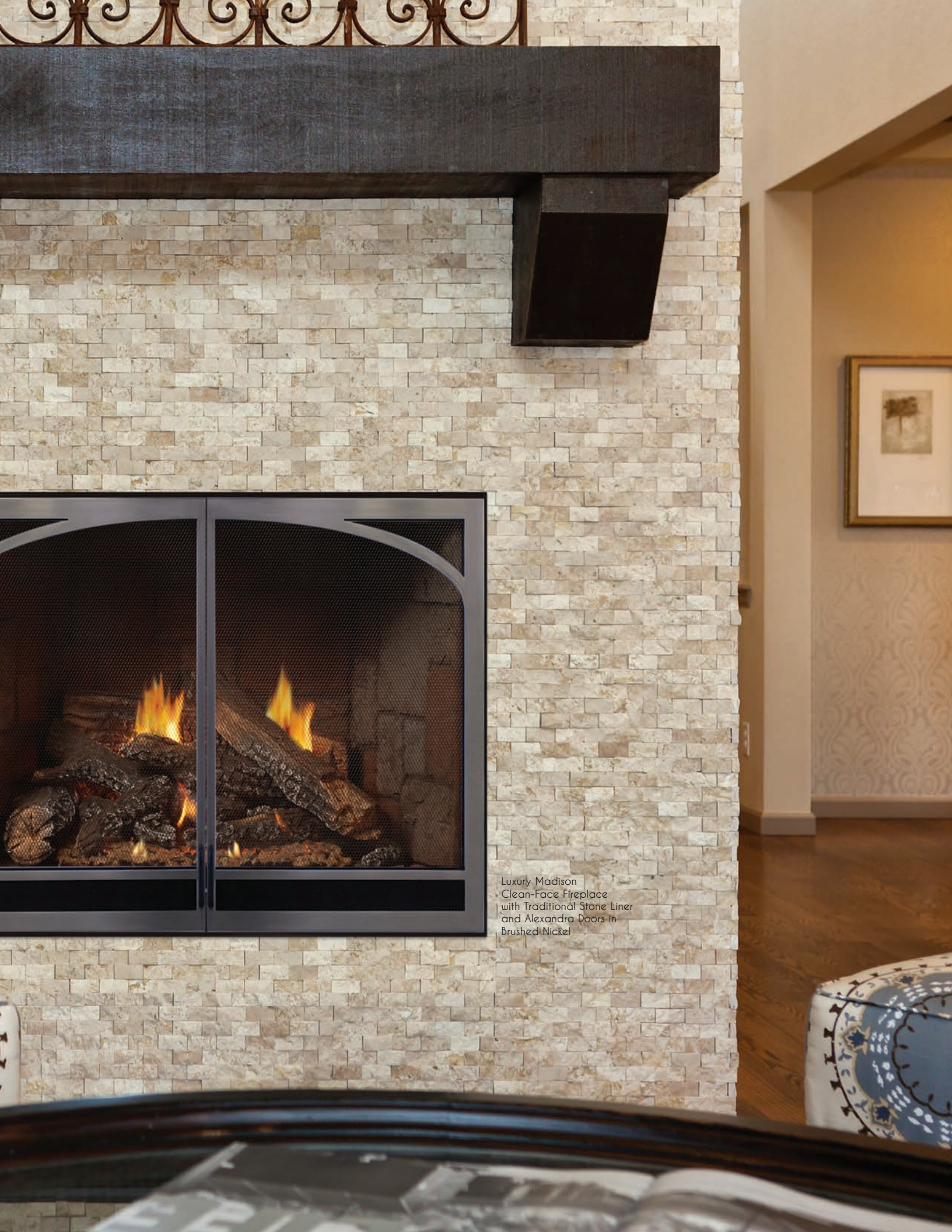
Luxury Madison Clean-Face Fireplace with Traditional Stone Liner and Alexandra Doors in Brushed Nickel