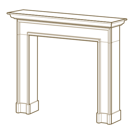
Eldorado Fireplace Surrounds Ship Complete with the Following Contents:

Stone Mantel & Legs Ledger Board & Screws for Easy Install